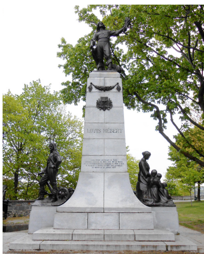
Monument Louis-Hébert.

Champlain described Hébert as “the first head of a family living in this country to live off his own crops.” This is why the artist chose to portray him atop this monument, sickle in hand, raising a fistful of wheat to the sky.