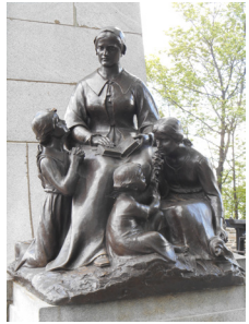
Marie Rollet Statue.