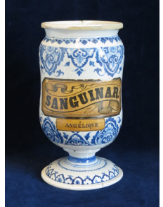
Pharmacy vase Sanguinar / Angélique, 17 th century.

The nun's former sleeping quarters have been turned into a "healing hotel." The museum includes a room that is dedicated to medicine, where we learn that the apothecary nuns prepared various types of medication, syrups, herbal remedies, pomades and ointments out of plants and herbs, both indigenous and imported from Europe, which were grown in the monastery's garden. There is now a square in the garden that is dedicated to these female apothecaries.