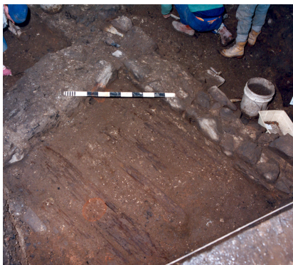
Remnants of the Couillard home.

Archeological excavations that took place in 1991 and 2002 uncovered the foundations of the Couillard home, whose perimeter can be seen in the Seminary's backyard, known as la cour des Petits [the yard for the little ones]. The house consisted of two square foundations that were built at different times. The first section was more rudimentary, its walls done in half-timber work, while the other, which was more recent and better adapted to the climate, was built with interconnected rooms. Among the artifacts found by the archeologists was an apothecary's weight, which would suggest that the older part was Louis Hébert's first house.