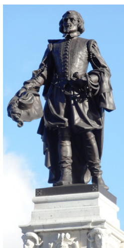
Samuel de Champlain Statue.

All over the region that was later named Sault-au-Matelot, there soon were grain fields aplenty, along with gardens and an orchard made up of apple trees that had been imported from Normandy.