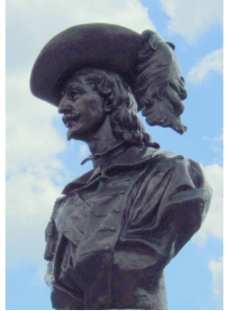
Bust of Pierre Dugua de Mons.

During his time in Acadia, Hébert would tend to the health of his fellow settlers, as well as Indigenous people, including one of their chiefs, Membertou. According to Marc Lescarbot, who wrote about the history of New France, "Hébert loved to till the earth" and he tried to cultivate vines. Hébert was a founding member of the Ordre de Bon Temps (the Order of Good Cheers), which held gastronomical banquets and was a source of entertainment in the small colony.